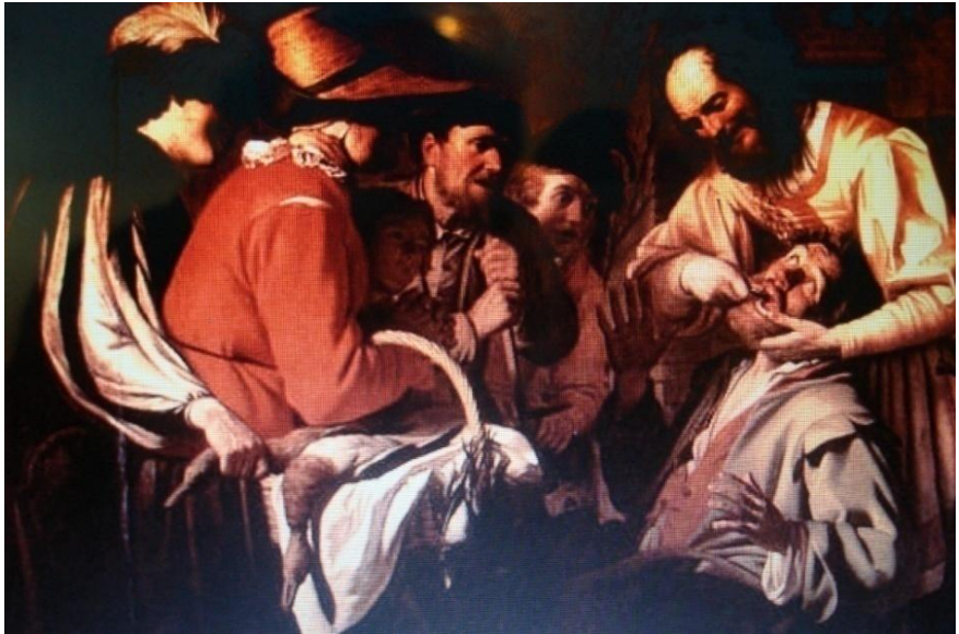
This paint showing barber practicing and teaching dental surgery as first step for Maxillofacial Surgery progress.