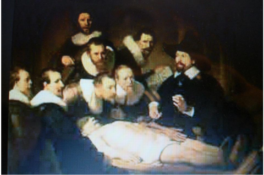
International paint shows surgical operation carried by eminent surgeons during 17 th century.