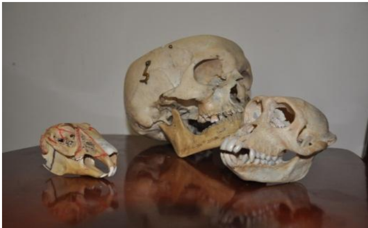
3 skulls, first one rabbit skull, second Monkey skull & human skull for my research and clinical application in TMJ Surgery.

We hope to present to our colloquies worldwide the fruit of our long and valuable experience and to share with them this knowledge and experience and we hope we did contributions to science.